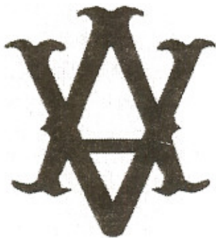
Amador Valley Dons