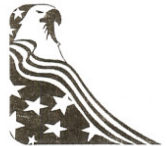
Harvest Park Patriots